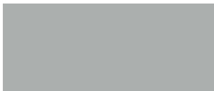
Goosewing Grey 222