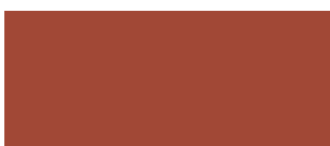
Tile Red 637

The applied colours may differ slightly from the examples shown above. Contact our customer services for a true colour sample or a special colour match.