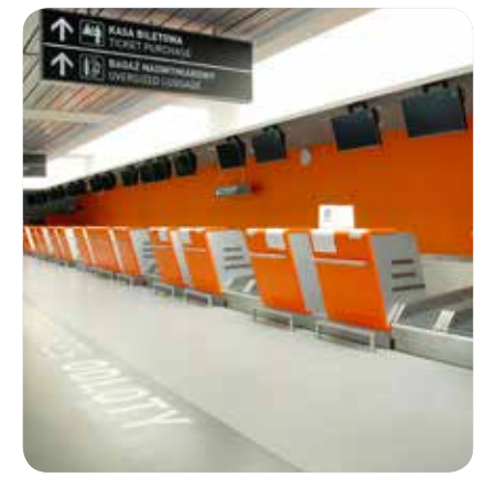
Railways & Airports