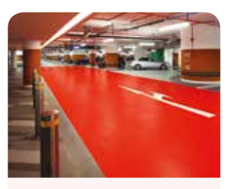
Basement Level Car Park Deck Systems