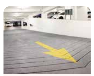
Heavy Duty Deck Systems for Ramps

In some instances, ramps are partially exposed to external weathering and rainwater and there can be significant movement affecting the joints connecting the ramps to multi-storey decks.