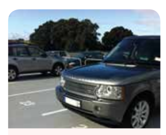
Roof Level Car Park Deck Systems